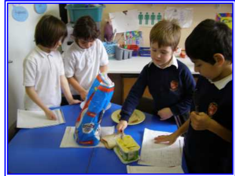
Children making sandwiches as part of their instructions writing activity

We ask the children what they would like to find out too.