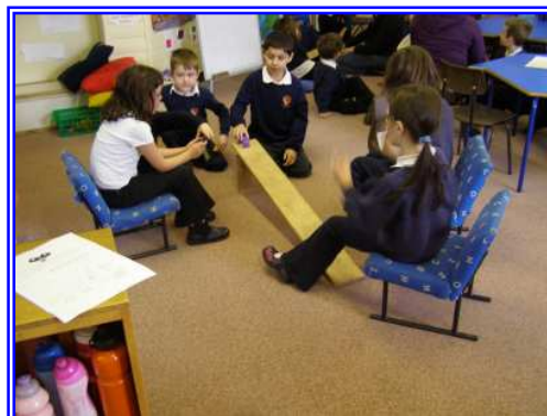
Investigating 'forces'. We do lots of practical activities to help us understand science.