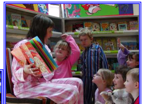
Dressing up in pyjamas for a story telling day