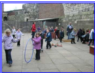
Playing with toys at the Castle Museum in York

Some skills we have to teach separately. Children have mathematics lessons every day; they learn their multiplication tables, learn how to calculate with numbers and learn how to measure. They also learn about shapes and data handling. They find out how to solve problems and they practise these skills in their topics too. Some literacy skills children need to practise every day too. Children learn how to read and how to write for different purposes and they learn how to spell and they practise these skills in their topics too. We organise exciting events to inspire children to read more. We often have authors coming into school; travelling book fairs and we have had a Monster Month of Reading.